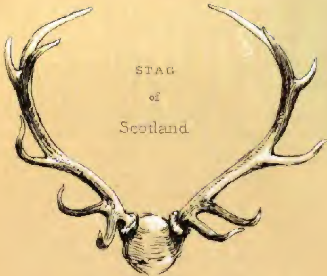
STAG of Scotland.